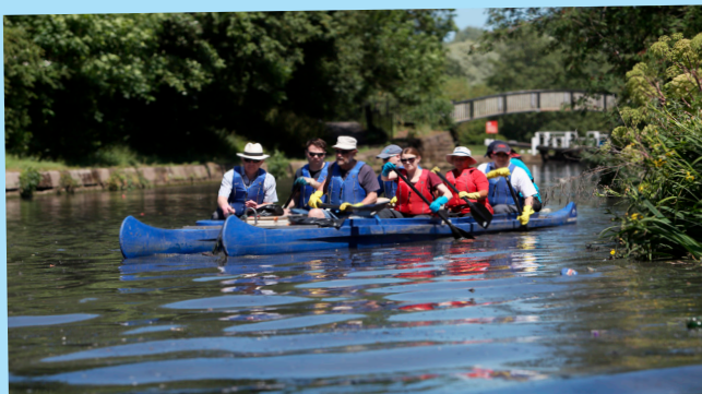
VOLUNTEERS LITTER PICKING ON THE RIVER SOAR

Over 400 volunteers have so far given up time realising nearly 2,000 volunteer hours, getting involved in litter picking, guerrilla knitting and tree planting - activities which have all enhanced the catchment.