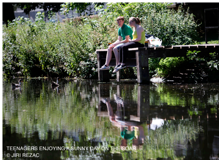
TEENAGERS ENJOYING A SUNNY DAY ON THE SOAR

Sharing lessons and successes across the wider river basin is vital so that positive impacts on the water environment can be maximised. Therefore, the Partnership is currently exploring opportunities to up-scale the Soar's successes; in particular its use of data, evidence and mapping with neighbouring catchments within the Trent.